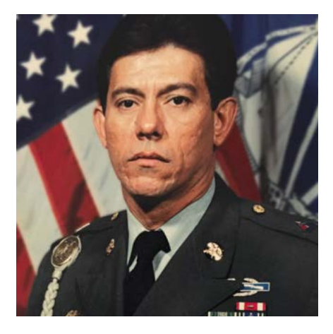
The Warrior Tradition

Learn the heartbreaking, inspiring and largely untold story of Native Americans in the United States military. This film relates the stories of Native American warriors from their own points of view—stories of service, pain, courage and fear.