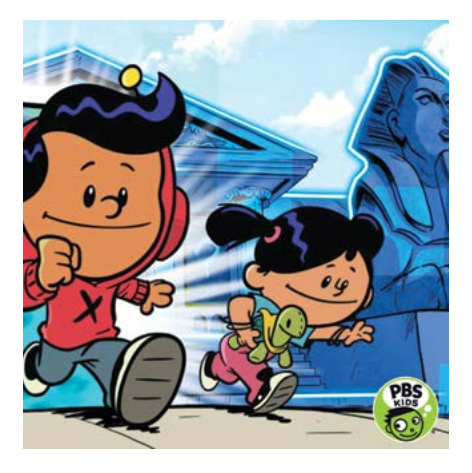
Xavier Riddle & The Secret Museum

Saturday, September 7 Tulsa Performing Arts Center