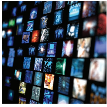
Local Live Streaming

OETA adjusted its daytime schedule to provide curriculum-based programming for students over the air on our broadcast channel, OETA WORLD. Programming directly correlates to lessons and resources made available through PBS LearningMedia which have been designed to meet federal and state standards for grades 6 through 12.