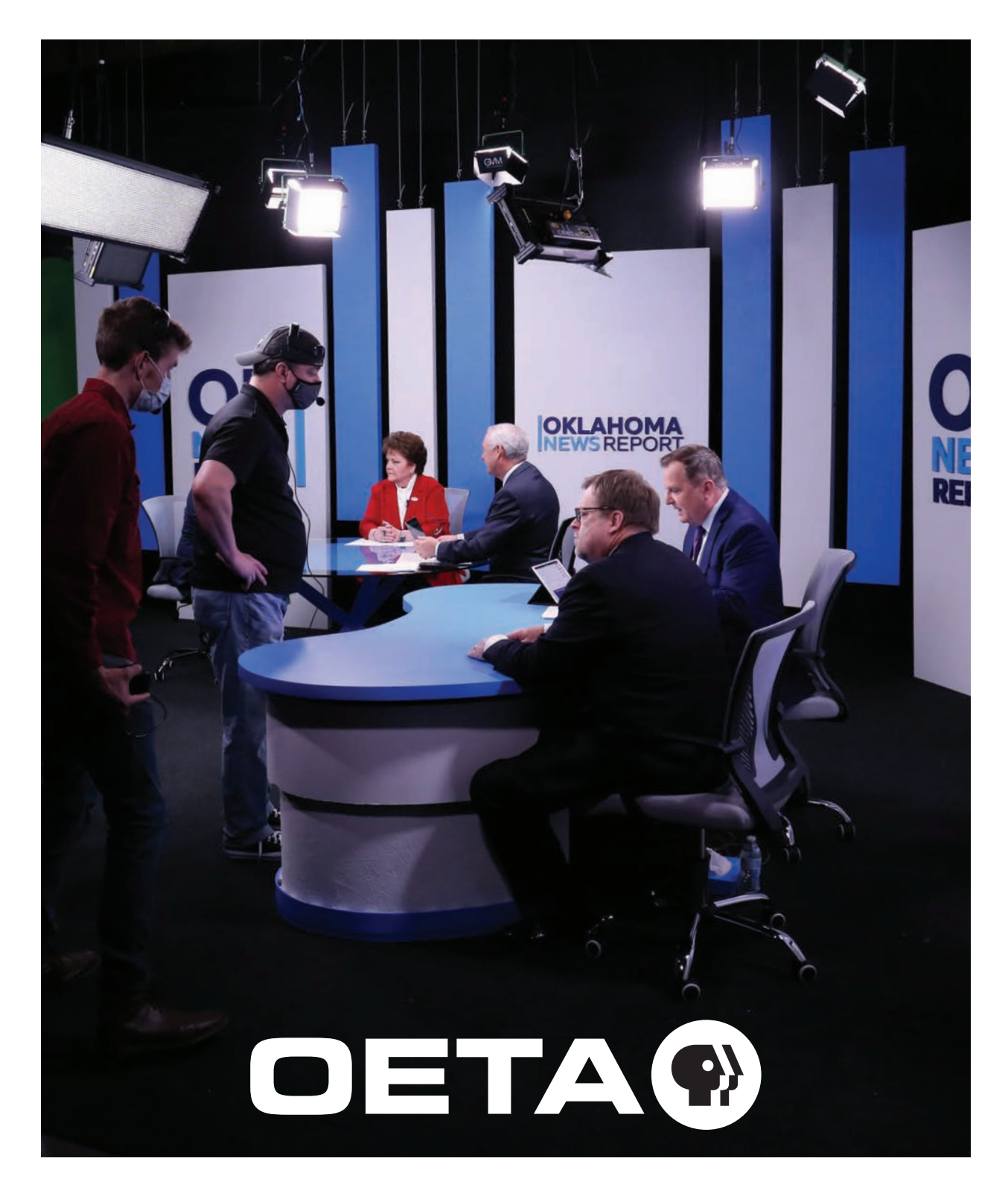
Local Content & Service Report To the Community