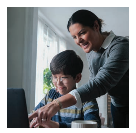
Learning at Home

OETA adjusted its daytime schedule to provide curriculum-based programming for students over the air on our broadcast channel, OETA WORLD. Programming directly correlates to lessons and resources made available through PBS LearningMedia which have been designed to meet federal and state standards for grades 6 through 12.